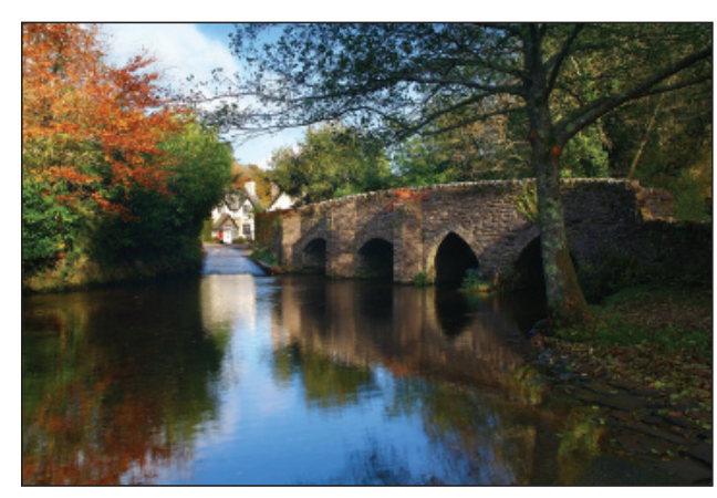
Bridge over the River Haddeo at Bury