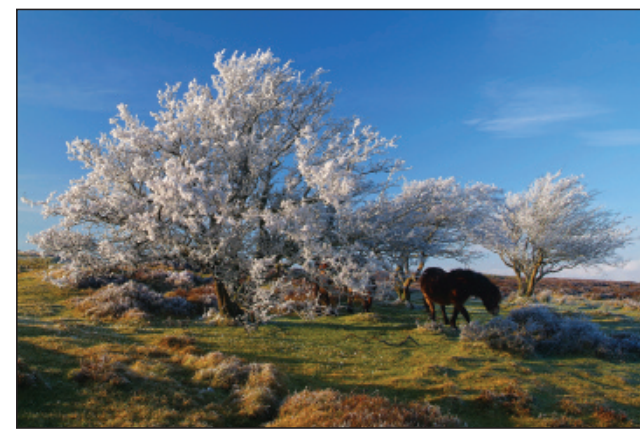
Exmoor pony forages by a frosted tree on Porlock Hill