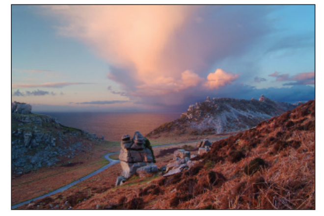
Storm over the Bristol Channel from the Valley of the Rocks, Lynton